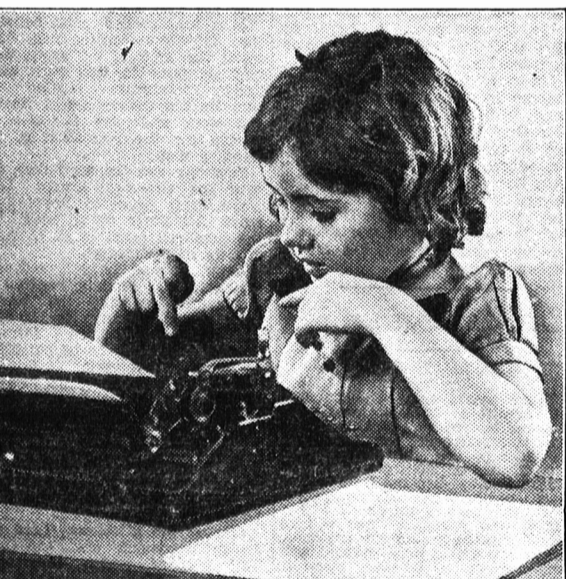
The simple subject-matter and plain background lend appeal to this child study. Strive for simplicity in your pictures.

SIMPLICITY is an outstanding feature of most good pictures. And an excess of detail—especially confused detail—is seen in most pictures that are not up to par. Mark Twain once wrote: "As to the adjective; when in doubt, strike it out." That is a good rule for the camera user. When you're in doubt about including some detail or omitting it—do the latter. It's a safer course. Nearly every picture includes a main subject which should be shown clearly. If the background is full of detail, it draws attention away from the main subject. Details in subject and background may even seem to run together, so that there is no clear separation. Thus, the picture is spoiled. It is easy to prevent this. Often, a change of camera position will change the whole background. In indoor shots, the background can often be cleared by moving one or two objects—such as a standing lamp or wall picture. Things such as this should be eliminated, unless they are proper and essential parts of the picture.