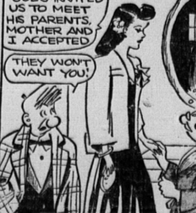
By George McManus