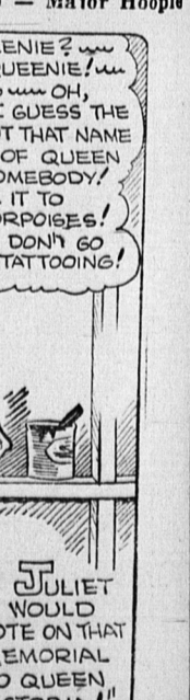
By George McManus