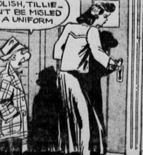
By George McManus