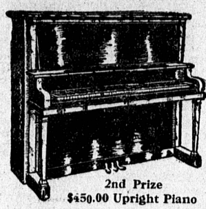
2nd Prize $450.00 Upright Piano

You Can Compete in This Grand Contest Absolutely Free of Expense This stupendous Contest is being conducted by the Publishers of "Everywoman's World" solely with the object of introducing Canada's greatest home journal into new homes and to new readers. In addition to the fine standard book of English Proverbs, and the series of twelve pictures, a copy of the current issue of EVERYWOMAN'S WORLD, is sent to you without charge because the publishers desire that you and your friends and neighbors have an opportunity of seeing this readable magazine. There is no monthly magazine published in Canada like "Everywoman's World," and you will be delighted to have the people in your home acquainted with a magazine so free, bright and entertaining. Remember you do not have to be a subscriber in order to compete, nor are you asked to subscribe to "Everywoman's World" or spend a single cent of your money. This great contest is absolutely free of all expense. The copy we will send you puts you under no obligation whatever.