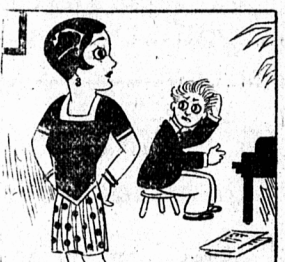
SHOULD COMPOSE HIS NERVES

"How long can you hold your breath?" "Oh, until the average fellow has bitten through with kissing me, I guess."