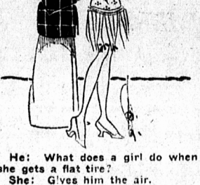
He: What does a girl do when she gets a flat tire? She: Gives him the air.