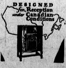
DESIGNED for Reception under Canadian Conditions