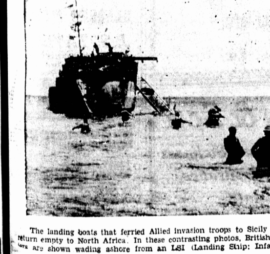
The landing boats that ferried Allied invasion troops to Sicily didn't return empty to North Africa. In these contrasting photos, British soldiers are shown wading ashore from an LSI (Landing Ship, Infantry).