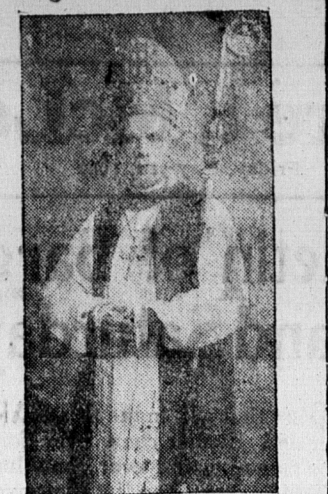
BISHOP HAMILTON, of Ottawa. Was elected Archbishop of Eastern Canada by the House of Bishops.

E. W. TAYLOR South Side Queen Square dmwtrwtf.