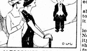
ALTOGETHER TOO CLOSE

"She's always talking about blue blood." "Such a pity she should be afflicted that way. Still, if she's eat the right diet, I'm sure it would soon be nice and red."