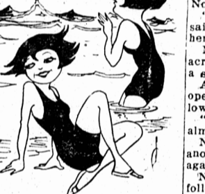
WATER? DON'T MENTION IT

"When you asked old Titewac for a contribution did you find him very distant?" "No, found him altogether too close."