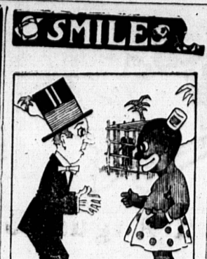
THEY HADN'T DINED

Missionary: Are those two boys you have there in that cage in your yard? Cannibal Chief: Not yet—we haven't dined.