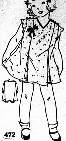
No. 472. Size... Name... Street Address... City... State

Illustrated Dressmaking Lesson Furnished With Every Pattern By Annabelle Worthington