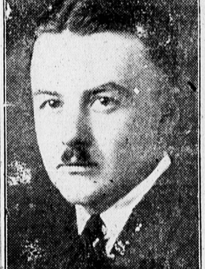
ADDED TO CANADA'S ROLL OF FAME

So if you have received a severe shaking up in any manner, and the back pains you, simply rest it until the pain disappears or you may always have a weak back.