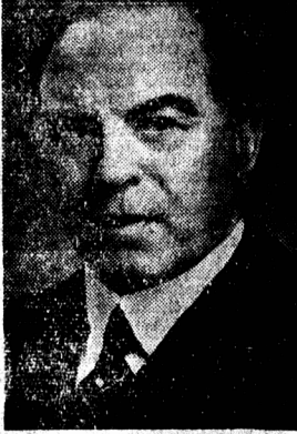
RT. HON. MACKENZIE KING whose Liberal Government was returned on the basis of a narrow margin.