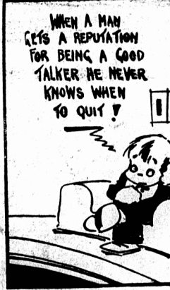
When a man gets a reputation for being a good talker he never knows when to quit?

SAN FRANCISCO, June 11 (AP) - A United Nations conference commission voted by acclamation today to bulwark a world league with powers to attack economic and social ills which have helped generate war in the past.