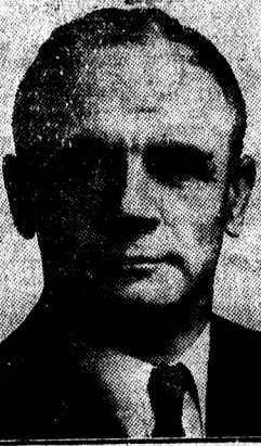
HON. JOHN BRACKEN whose Progressive Conservative party elected 60 members on the basis of incomplete returns last night.

(By The Canadian Press) Prime Minister Mackenzie King today appeared assured of continuance in office as head of a sharply reduced Liberal majority in the new House of Commons.