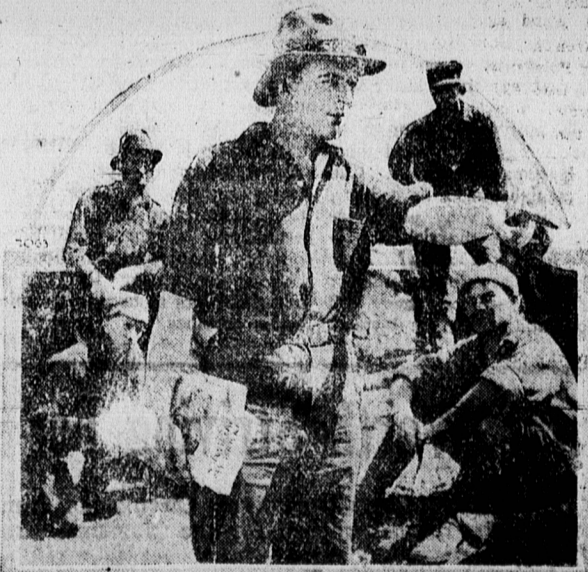
WALLACE REID in "The Source"