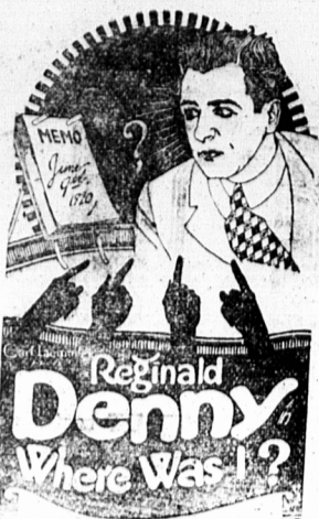
Reginald Denny Where Was I?

Fox News--Pathe Review--Orchestra TOMORROW--BUCK JONES--in--"MAN FOUR SQUARE"