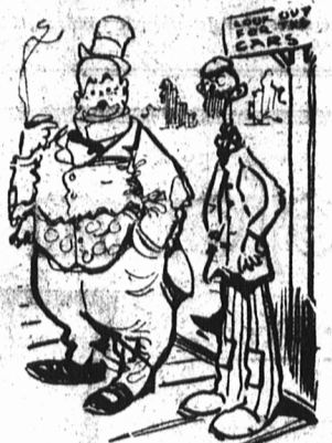
SO ACCUSTOMED TO IT.

Mrs. Jinks—Is your husband an advocate of labor union? Mrs. Hinks—I should say so. Why he won't eat a brick of ice cream if it hasn't got the union label on it.