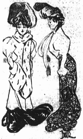
THERE YOU ARE.

Knicker—Isn't there a scandal connected with this new subway scheme? Backer—I understand there are some underground deals about the matter.