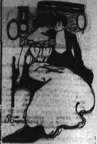
PRETTY NEAR IT.

She—Miss Oldgirl is to be married next month and she will live abroad. He—It will be hard for her parents to lose her. She—Oh! I don't know. They've been trying hard to lose her for the past 12 years.