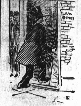
KEPT TABS ON 'EM.

Geraldine—You haven't kissed me for five minutes. Gerald—Well, I'll bet that I have kissed you for four minutes and fifty-nine seconds.