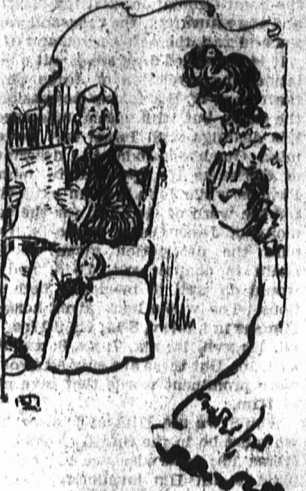
NOT QUITE SO BAD.

Mrs. Henpeck—I'm a woman of few words. Mr. Henpeck—But you work those few for all they're worth.