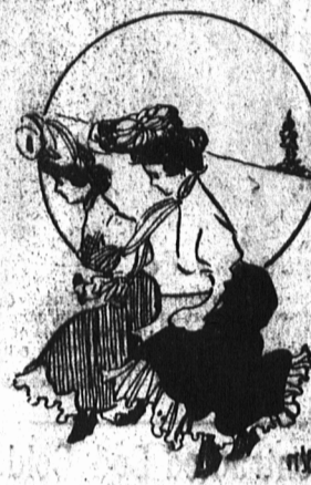
THE OVER-CROWDED CRAFT.

Golf is a game in great demand—It's splendid—none can doubt it; it takes three hours to play it, and three weeks to talk about it.