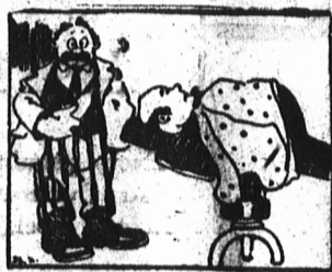
CALLED HIM DOWN.

Jimpson—Is Watson a pleasant talking man? Simpson—Yes—if you don't get him started on religion, golf, automobiles or politics.