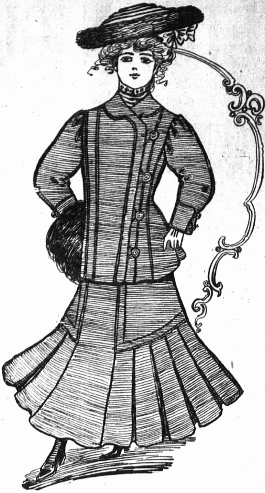
A modish street two-piece suit for Miss. It is made of tobacco brown, stitched with gold on the bias bands that form the simple trimming. Brown bone buttons are used on the jacket.