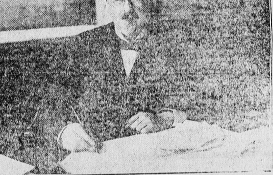
A "SAFETY FIRST" MANAGER FOR BRITISH CONSERVATIVE PARTY

The Canadian National is renowned for the excellence of its sleeping and dining car service. The cars are of the finest and most modern type, while the quality of the food and manner of service on the diner is praised by hundreds of experienced travellers.