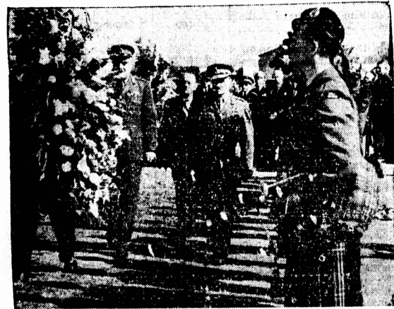
Major-General J. H. Roberts who commanded the 2nd Canadian Division during the 1942 attack on Dieppe is shown left, above, with Major-General A. E. Walford, former Adjutant-General of the Canadian Army as they place the wreath at the base of the Cross of Sacrifice at Dieppe cemetery during the ceremonies which were attended by thousands. This wreath was presented on behalf of the people of Canada.