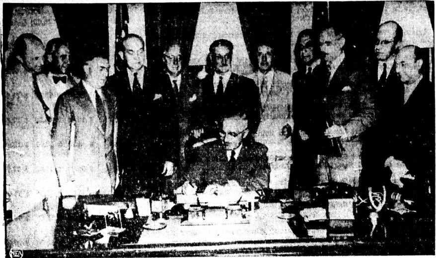
IT'S OFFICIAL — In a White House ceremony, President Truman signs the official proclamation stating that the North Atlantic treaty is in actual operation. Standing behind him are representatives of the other four nations, Secretary of Defense Louis Johnson (fourth from left) and Secretary of State Dean Acheson (third from right).