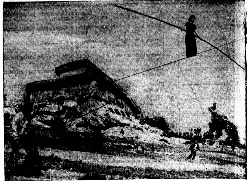
TENSE SITUATION IN BERLIN —A girl tight-rope artist starts a 50-foot high balancing feat above the Tiergarten, in the British sector of Berlin. The German circus troupe has stretched the high-wire between two bomb-shattered air-raid shelters on opposite sides of the Landwehr Canal. Here they rehearse their acts before going on with the big show.