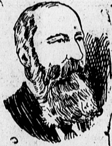
KING LEOPOLD OF BELGIUM WHO IS SAID TO BE IN A CRITICAL STATE OF HEALTH.