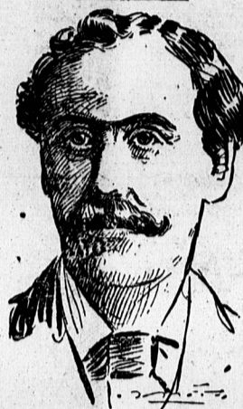
WHO IS THE NEXT PROBABLE GOVERNOR GENERAL OF AUSTRIA.