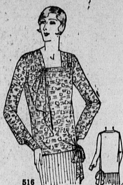
CHIC BOW TIED HIP

A simple jumper blouse like Style No. 516 is best to choose for general utility wear. It is sketched in red and white combination for immediate and summer vacation wear.