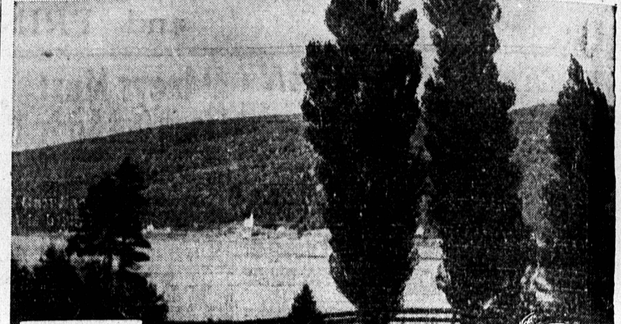
WHYCOOMAGH Cape Breton