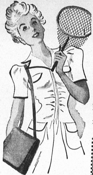
HOW TO KEEP DRESSES

If many hearts you would enmesh keep summer dresses trim and fresh