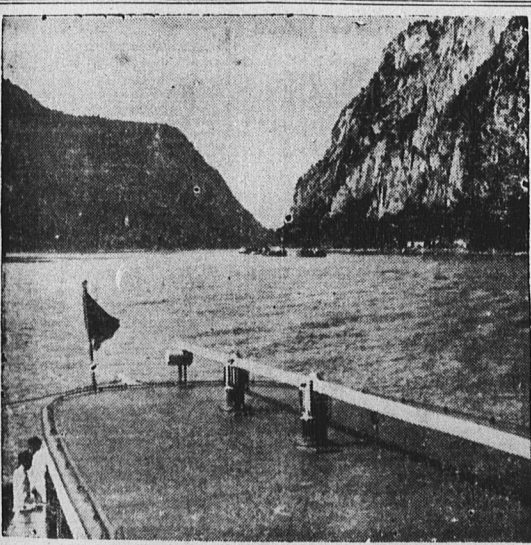
"Bottleneck" of river between Germany and Rumania is the Iron Gate, where the Danube narrows between Rumanian mountains. Here, too, British bombs could play havoc with Nazi freight.

ENERGETIC MAN OR WOMAN wanted to travel and appoint agents for old established house. Yearly guarantee of $1,092. Plus traveling expenses. Excellent opportunity. Write Dept. H, Box 32, Toronto 4. N-238.