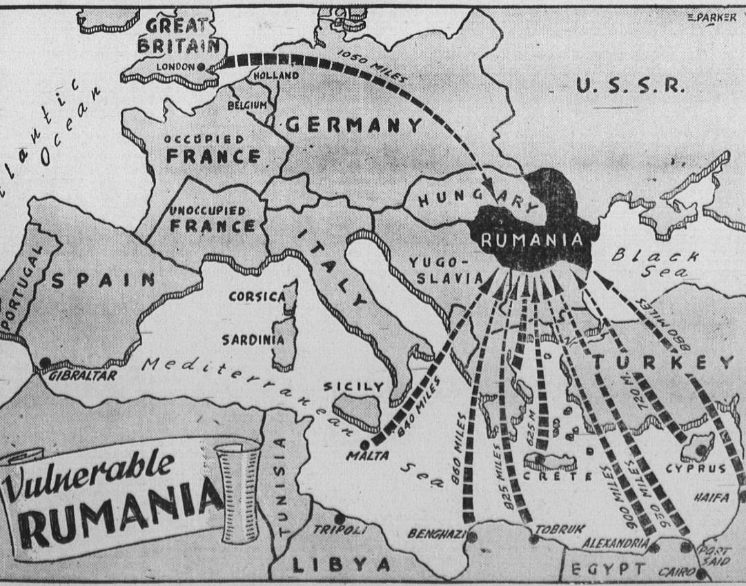
Ringed by bomber bases within a few hours' flying time, Rumania's oil production could be battered hard by the R.A.F. Even closer, if Rumania is used as a stepping-stone to Bulgaria and Greece, drawing Turkey into the conflict, would be the short hop from Turkey across the Black sea. Once guaranteed by Britain, Rumania's security has been forfeited by her easy complaisance to Nazi demands.