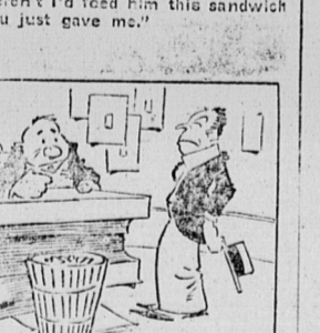
Manager: Say, I want a super to take the part of a king. You'll get 50 cents a performance. Applicant: Sorry, but I can't assume the affairs of state for any thing like that.