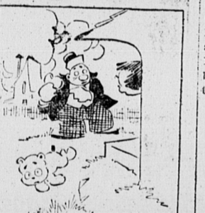
"Madam, pardon me, but are you really fond of your dog?"