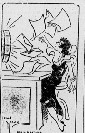
"A windy secretary has a lot of correspondence to blow about."