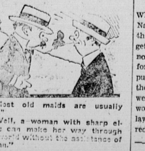
"Most old maids are usually thin." "Well, a woman with sharp elbows can make her way through the world without the assistance of a man."