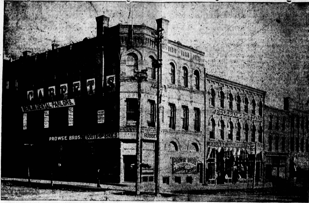
Prowse Bros., Limited., Today 1925

BEAR THIS IN MIND THAT EVERY DOLLAR YOU SPEND HERE MEANS A BIG SAVING TO YOU AND ALSO MEANS A DONATION FROM YOU TO THESE WORTHY INSTITUTIONS.