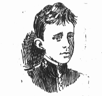
ALFONSO XIII, KING OF SPAIN

ST. CATHERINES, April 4.—Hon. H. R. Emmerson and his daughters arrived in the city today for the purpose of looking over improvements in the Welland canal. The party afterwards left for Niagara Falls.