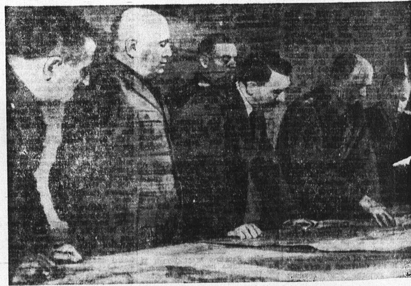
AXIS ANSWER TO CHURCHILL - ROOSEVELT MEETING