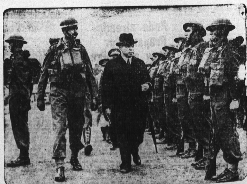
PRIME MINISTER INSPECTS CANADIAN TROOPS Overseas Sports.

This is Hitler's and Mussolini's answer to the momentous meeting between Prime Minister Churchill and President Roosevelt. Radiophoto shows the Axis chieftains with their