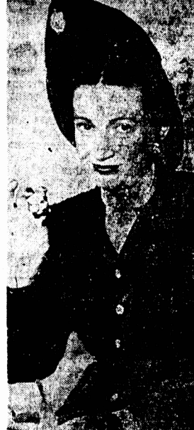
GUEST OF H. R. H.

Charges "Malicious Attitude" Towards The Soviet Union.