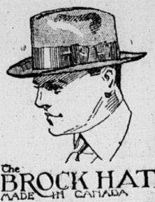
THE BROCK HAT MADE IN CANADA

See our $5.00 hat best value in Canada today.