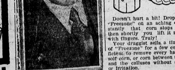
HENRY P. FLETCHER

According to reports from Washington and Florida, Henry P. Fletcher, formerly American Ambassador to Mexico, is to be Undersecretary of State in the Harding Cabinet. Earlier it was reported that he was to be named ambassador to Tokio. Mr. Fletcher, who is from Pennsylvania has been in the diplomatic service for years, serving under the Wilson administration as Ambassador to Mexico until he resigned.