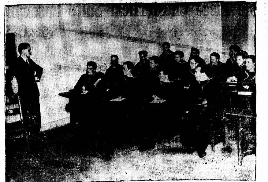
In aiming at an efficiency not far short of that obtained by permanent force men, the Reserves take their studies seriously. However, there is always room for some spontaneous humor.

Already well beyond any previous peacetime strength, and with an intensive recruiting campaign bringing in more men daily, members of the Royal Canadian Navy (Reserve) are fully utilizing the splendid training facilities of the 20 naval divisions reaching across the Dominion. Here are shown typical scenes in one of the establishments.