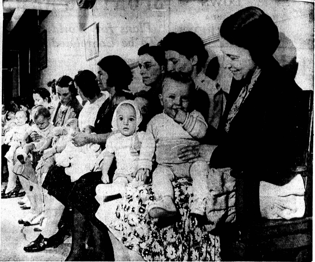
With a tremendously increased number of women in war industry in Canada peace time services such as child care are extended to meet new demands. At La Goutte de