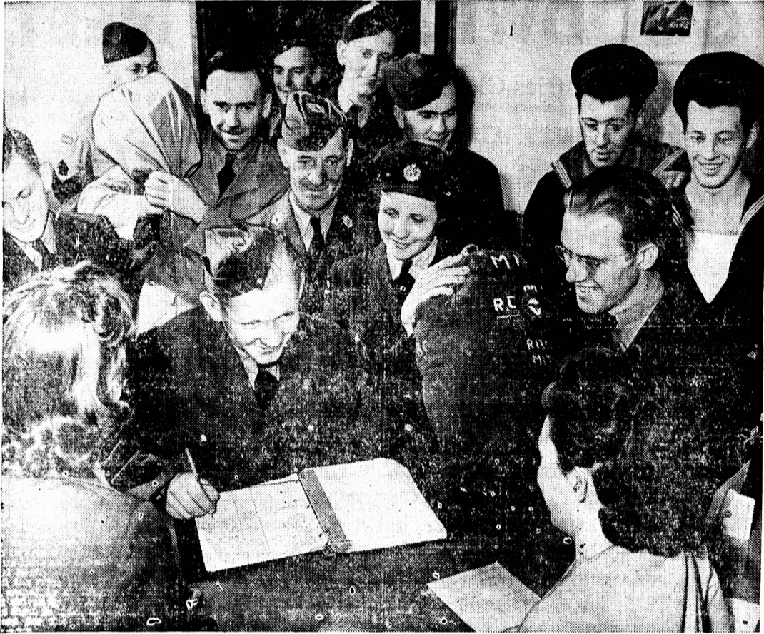
Women's organizations across Canada are assisting the Department of National War Services in all-out effort to make National Volunteer Week, September 12th to