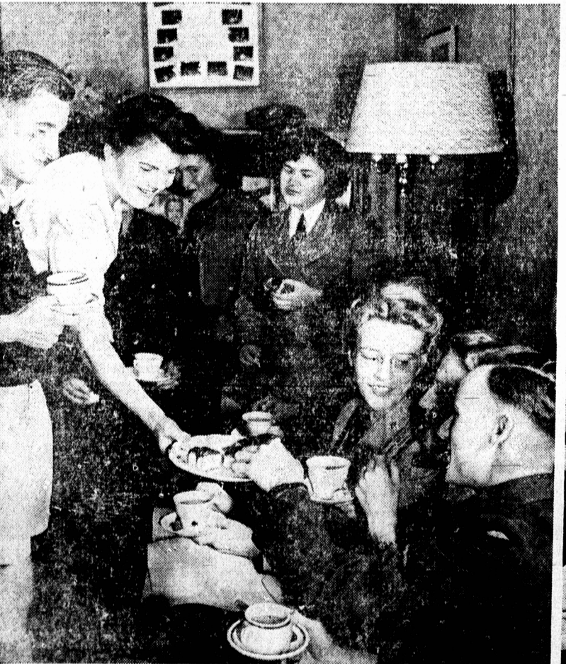
At the Y.W.C.A. Hostess House in Vancouver service men off duty and on leave find a home-like atmosphere of cheerfulness. Many facilities and aids to men in uniform are available, including a welcome snack with volunteer workers.