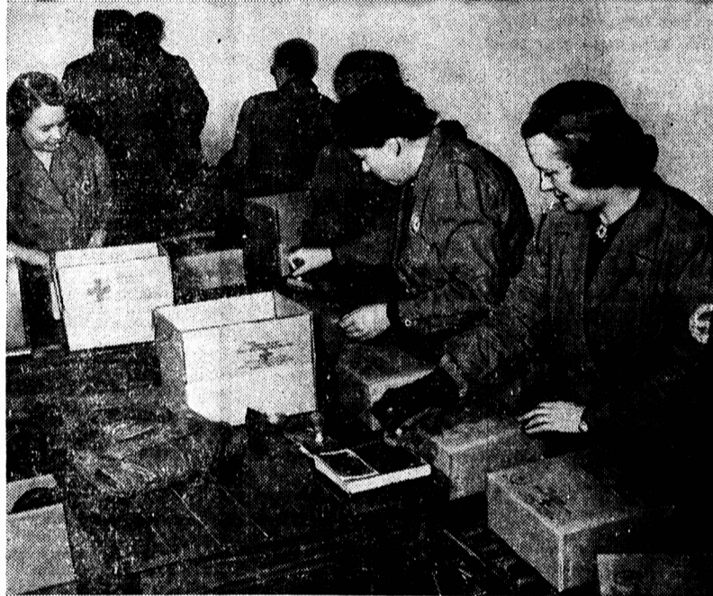
At the Red Cross prisoners of war packing depot in Toronto packages are filled with comforts and sealed by women volunteers with the organization's frank. On next floor packages are loaded into wooden crates for shipment to prisoners of war.