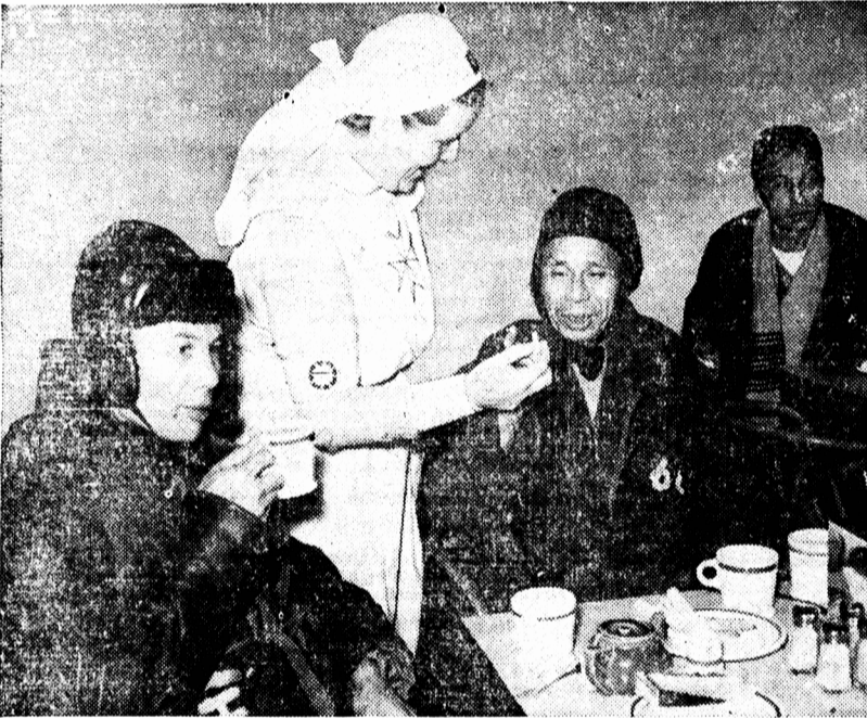
Chinese survivors of a torpedoed vessel receive food and cigarettes from one of the Saint John Ambulance Brigade workers at the Navy League Seamen's Home in Halifax. Navy League also provides canteens, amusement centres for seamen.