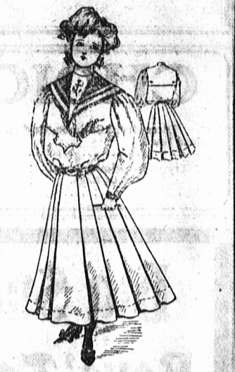
MISSIE'S SAILOR SUIT, CONSISTING OF BLOUSE NO. 311 AND SEVEN-GORE PLAITED SKIRT. (No. 3135.)

Sailor models continue to be the favorite for growing girls' and misses' wear. Green and blue plaid mohair was used to make this stylish suit. The collar of plain blue was trimmed with green braid. The pattern is equally pretty for washables, as the style is one that lends itself to tubbing. The blouse is fitted by shoulder and underarm seams, and slips on over the head. It may, however, be finished to open down the front. The applied yoke facing may be omitted, if preferred, and the collar made separately. The sleeves are of an entirely new shape, cut very full at the top and fitted to the waistband with tucks. The skirt is of the popular seven-gore variety, with deep backward turning plaits overlapping each seam and forming an inverted plait at the centre back. It is an admirable style for making up as a separate skirt, and will develop excellently in storm serge, cravenette, knickerbocker tweed, Rob Roy checks, plaids, mohair and covert cloth, as well as for linens, ducks and piques. The waist pattern (No. 3131) is cut in sizes 12, 14 and 16 years and requires 2 1/2 yards of 36-inch material, with 2 yards of contrasting goods for the 14-year size. The skirt pattern (No. 3135) is cut in sizes 12, 14 and 16 years, and requires 4 yards of 36-inch material for the 14-year size.