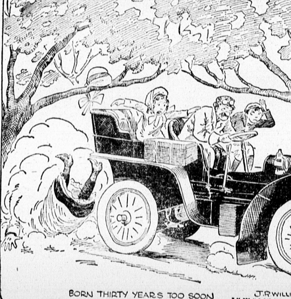
BORN THIRTY YEARS TOO SOON