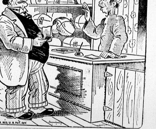
With — Major Hoops

HERE ARE A FEW SOILED COLLARS, CHARLEY AND I'LL HAND YOU A CHECK NOW FOR THE TRIFLING SUM I OWE YOU BY THE WAY, I HAVE BEEN ASKED TO ATTEND THE REPUBLICAN AND DEMOCRATIC NATIONAL CONVENTIONS SOON—HAVE YOU ANY PREFERENCE FOR PRESIDENT?