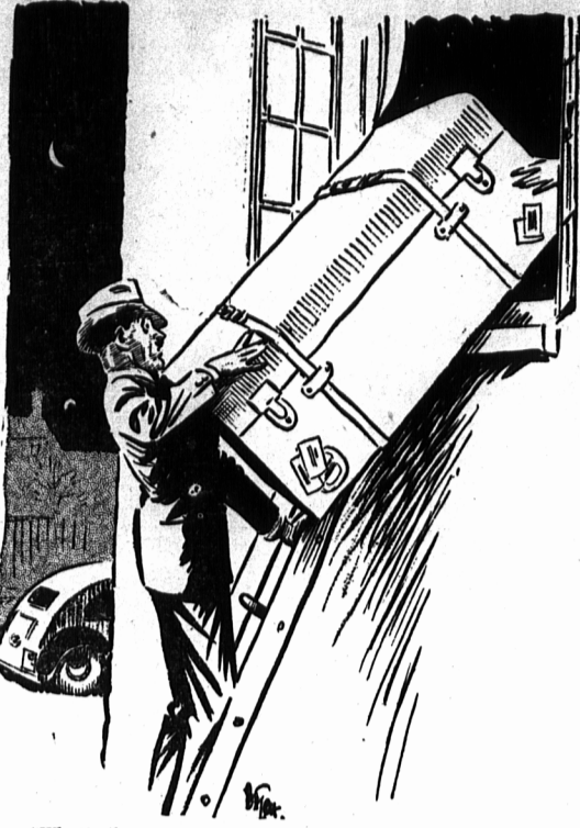
"What's the idea of this, dear? Are you inside it?" -London Opinion.