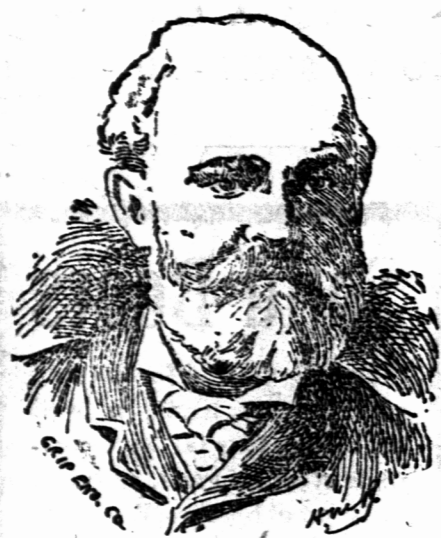
HON. A. G. BLAIR

SPEEDY ELECTION, SAYS BLAIR. TORONTO, Nov. 5. (Special)—Hon. A. G. Blair has ventured the prediction that all signs point to a speedy general election, although Mr. Tarte had told him there would be another session.