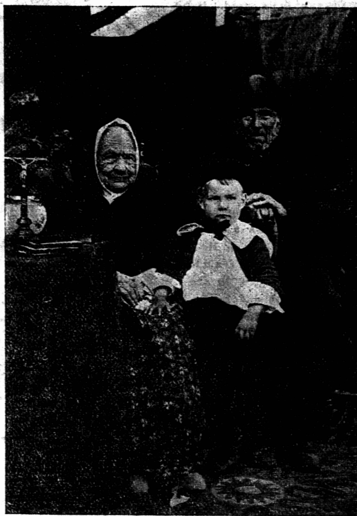
THE FIRST AND FIFTH GENERATION.