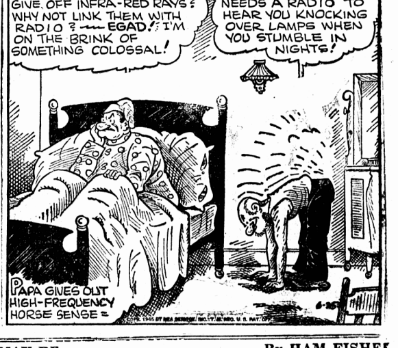
IT MAY BE... By HAM FISHER.