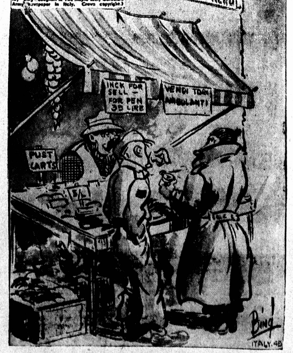
"Dassa sixteen jewel, putta da las one een myself!"