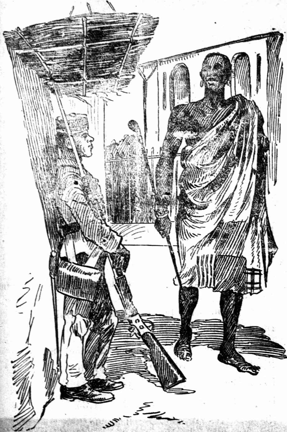
Portugese Ruler and the Ruled at Delegoa Bay.

s Open $15.00 for to advertise red from the and blood H. better one orth. New ctoria Row. C. a husban son from enings out. educatng influence in piano—a piano we ment plan