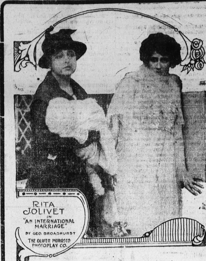
RITA JOLIVET IN "AN INTERNATIONAL MARRIAGE" BY GEO. BROADHURST THE OLIVER MOROSCO PHOTOPLAY CO.

OF THEATRICAL INTEREST.—Charlottetown theatre goers will be interested to learn that the great comedy "Charley's Aunt," which is said to be the funniest comedy ever written, may soon be seen in Charlottetown by the English Company