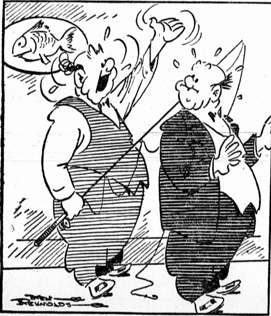
"I didn't either get it with a Guardian Want Ad—I was using worms!"