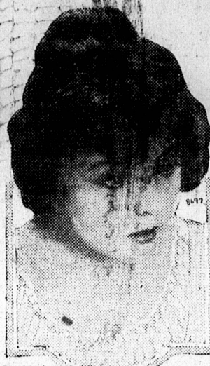
ENID BENNETT in "Happy Though Married"

Is your Marriage a success or a failure? Lots of couples who are trying to kid the world they are happy, will be deeply interested in the problems which come up in this picture, and how Enid Bennett handles them! Her husband is just like yours. Newspaper and all. And you can do what Enid Bennett does! A hundred laughs for the married folks, and single ones too.