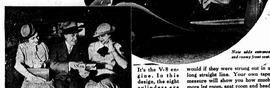
Actual photograph showing roomy rear seat of Ford V-8

WHEEL-BASE This is the outside distance from hub of front wheel to hub of rear wheel. ROOM-BASE The inside body room of the car—the distance from the dash to back of rear seat.