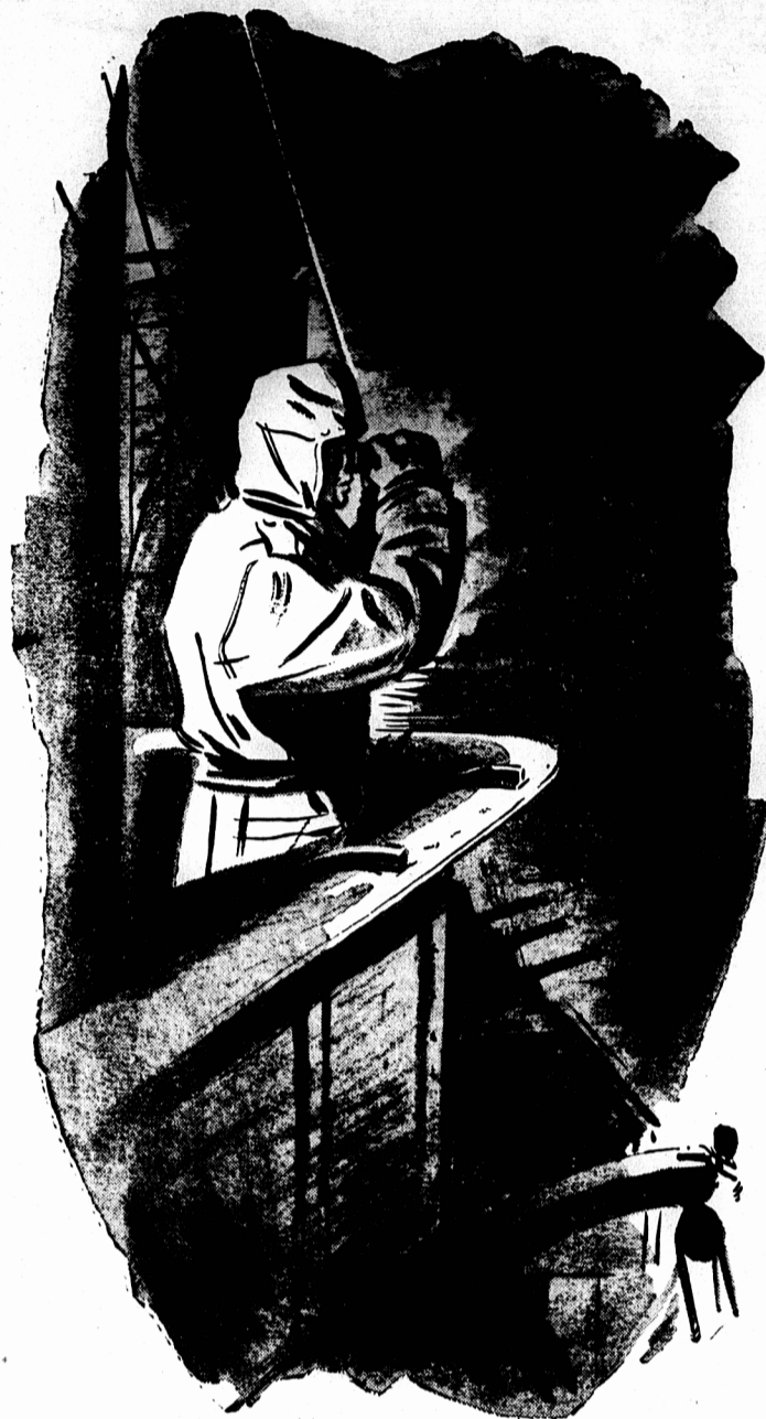
It isn't easy to stand watch on the bridge of a destroyer... watching the sea for the trail of white that warns where a submarine waits...