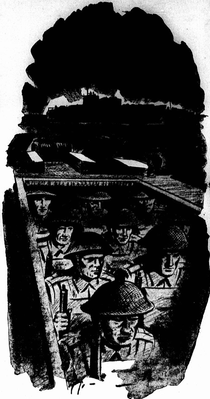
It isn't easy to crouch low in a landing barge... waiting the order that will send you scrambling to the attack...