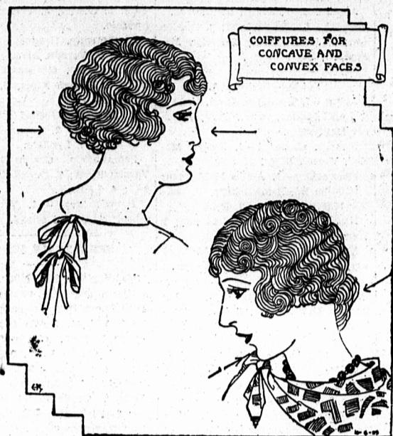
Place the coil of hair on a level with the receding feature