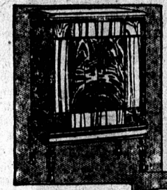
VICTOR RADIO-ELECTROLA RE-45 Complete with tubes $375