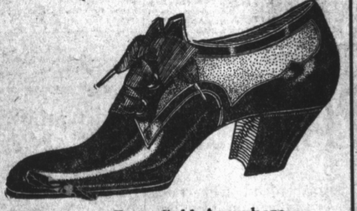
No Better Boots Sold Anywhere