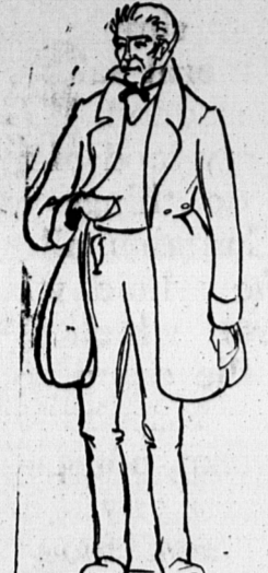
BROWN SUIT—BLACK SHOES GREEN VEST—BLACK AND GOLD WATCH CHAIN—FLESH TINT ON SKIN

Adapted for boys and girls from the famous story by Charles Dickens.