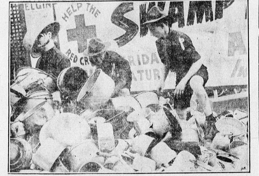
Boy Scouts are still carrying on the aluminum campaign in many centres. Above, Ottawa Scouts working at one of their piles.