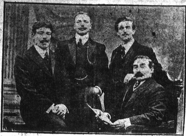
THE MEISTER GLEE SINGERS. England's Greatest Quartette.