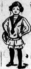
P. E. Island's greatest clothing house.

The neatly dressed carefully dressed Boy becomes the smart well groomed man invariably. You can best impress upon the boy the paramount value of appearance in his future career by dressing neatly while learning his lessons. Bring him here where he can see the exact one he has in his mind. Prices $2.75 to $8.00.