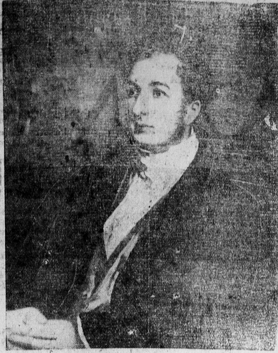
The Founder of Guelph—Photo of Mr. Galt to the city of Guelph in connection with the centenary celebration.