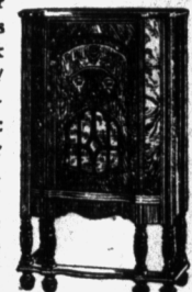
As illustrated VICTOR R-88 $98